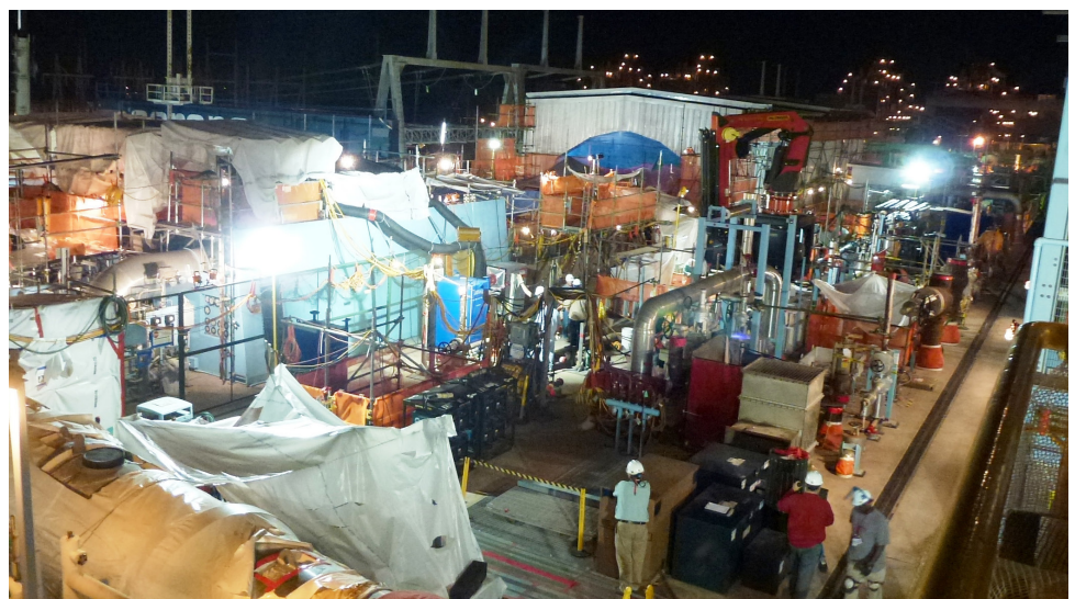
Thousands of additional workers upgraded pipes, valves and other plant equipment as part of the around-the-clock Extended Power Uprate project completed in April 2013.