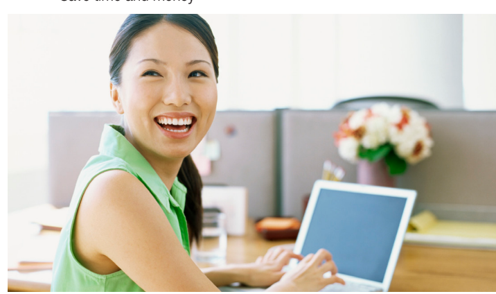
* You set up the payment withdrawal date for anytime between 11 and 20 days after your electric bill is issued.

With FPL Automatic Bill Pay, we do the work while you take care of your business. Plus, when combined with FPL E-Mail Bill, your accounts payable process is further simplified. Think about it – your company's electric bill gets paid automatically every month and you can view and manage your bill online, anytime!